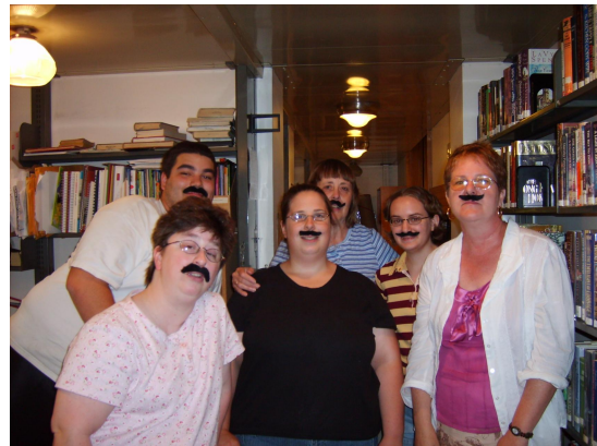
Library Staff had a fun summer too!